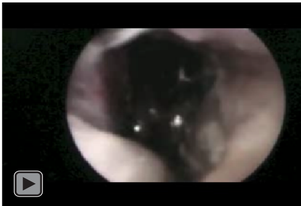
Fig 5 online video Abnormal nasendoscopy. Significant supraglottic soft tissue oedema affecting the valleculae, epiglottis, and both aryepiglottic folds. If reading the pdf online, click on the image to view the video.

potentially with consideration given to awake techniques. DMV can also be suggestive of difficulty in subsequent laryngoscopy.