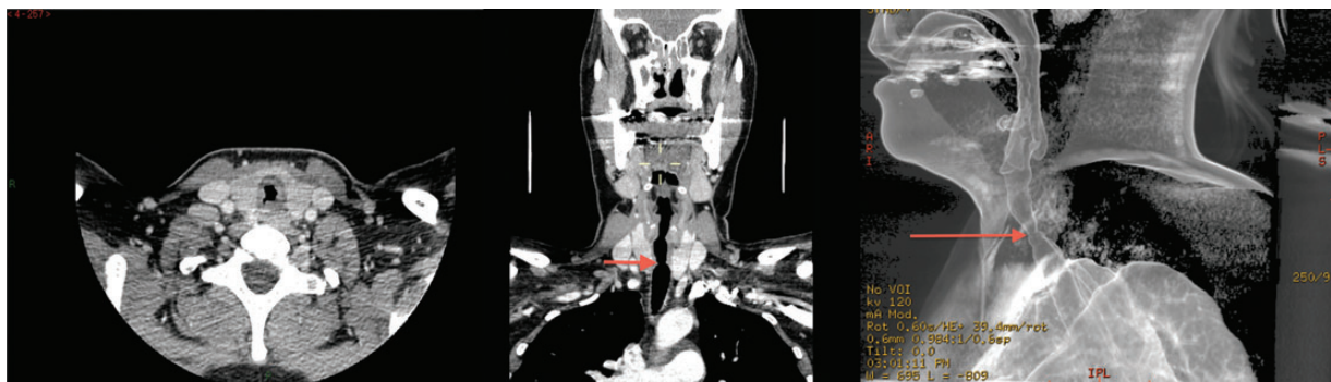
Fig 3 Coronal CT slice, MPR, and 3D CT reconstruction showing significant subglottic stenosis (arrowed) secondary to granulomatosis.